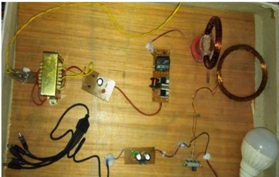
Figure 2: Layout of Wireless Power Transfer System